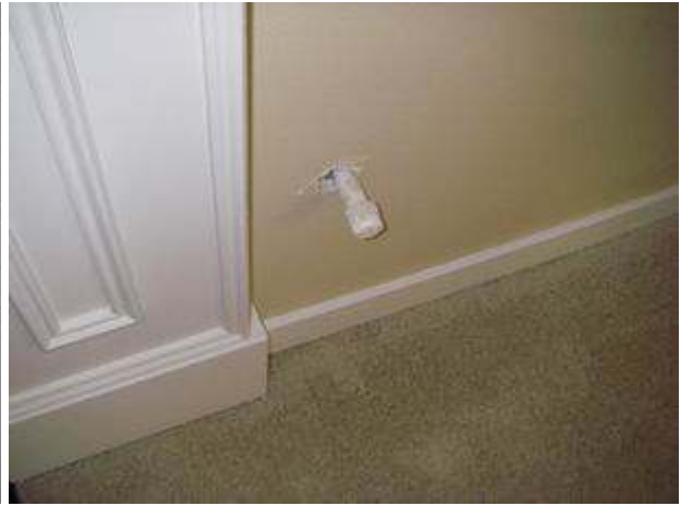
12 gas line stub-out