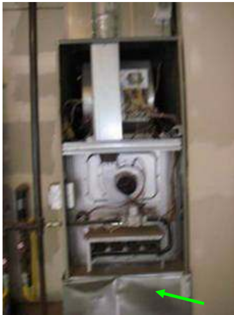
11 12 Armstrong furnace (note damaged plenum)

5 6 The requisite one-inch clearance between the b-vent exhaust flue and the 7 surrounding ceiling wallboard has not been achieved. A one-inch clearance to 8 combustibles is required around all b-vent flues but in a garage the gap must be covered 9 with sheet metal to retain the fire-rating.