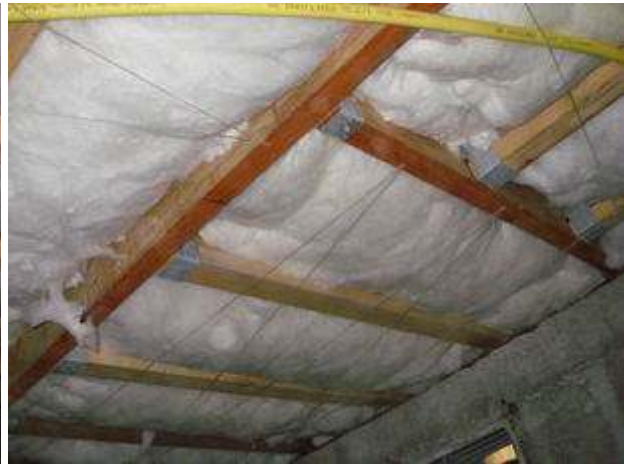
21 properly installed hangers at fireplace