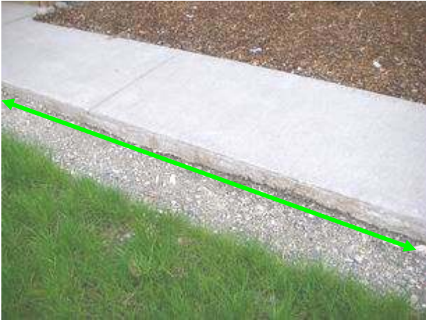
embank bottom of walkway