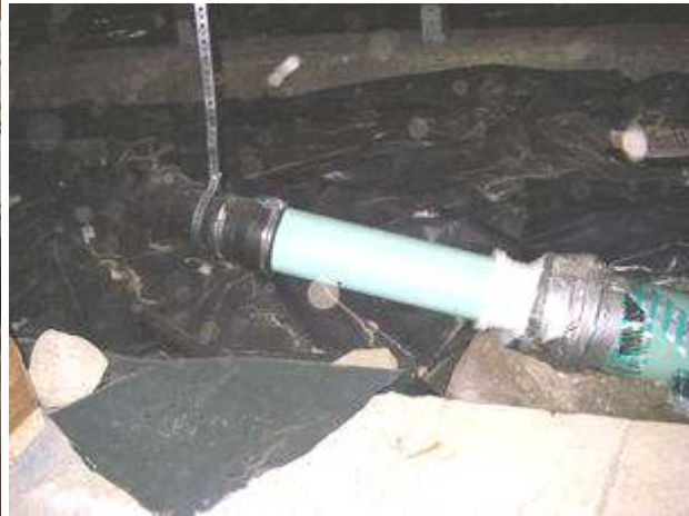
6 7 “spliced” sewer pipe

8 Water volume (flow) is adequate when two fixtures are running simultaneously. In the 9 course of this inspection, the main water shut-off was not located; a conversation with the 10 builder on this point is recommended. Unless otherwise noted, the water meter at the street, 11 the water line from the street to the house, and the plumbing fixture at the washing machine 12 hookup were not operated/evaluated; these items and the washer water supply lines are 13 exempt from this inspection.