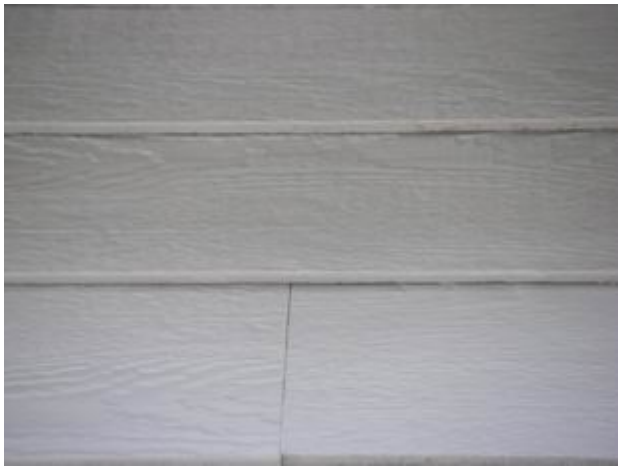
butt joint uneven & not caulked