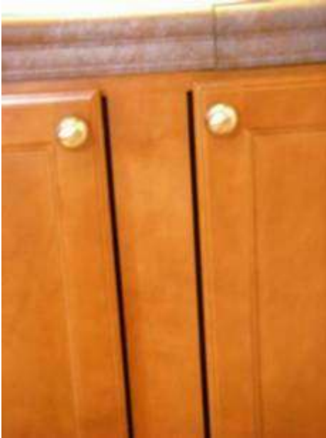
misaligned cabinet doors