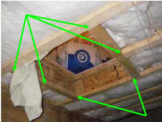
20 joist hangers & nailers required at these points

9 The crawl space is accessed via a pass-through in the understair closet. No significant 10 defects were observed in the concrete perimeter footings, strip footings, or foundation walls. The 11 foundation framing consists of 9½-inch Louisiana Pacific thin-web floor joist 16 inches on center 12 mounted on 4x10 beams supported in turn by 4x4 posts. The header installed at the access and 13 carrying one joist has been improperly nailed into place. Nailing through the chords is 14 prohibited; hangers should have been used (as they were at the fireplace bump-out). The 15 top chord of another joist has been notched for plumbing clearances, another prohibited 16 modification. All manufactured joist companies dictate that their products not be modified 17 in either of these ways and if they are, that the manufacturer must be contacted to design the 18 appropriate repair to keep the warrant in force. 19