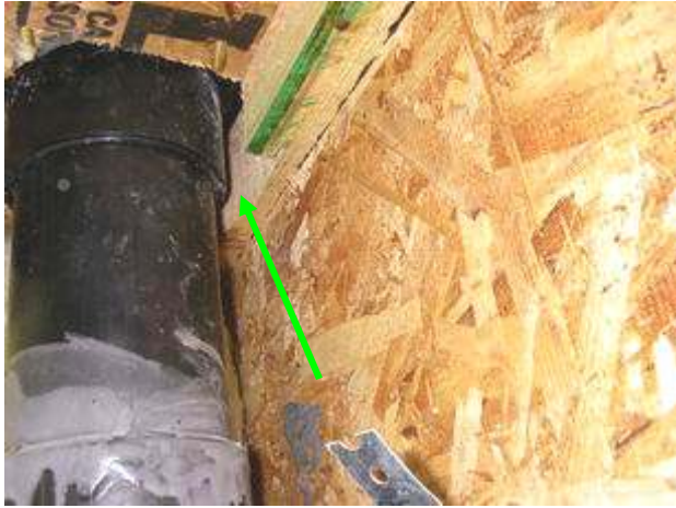
2 notched top chord