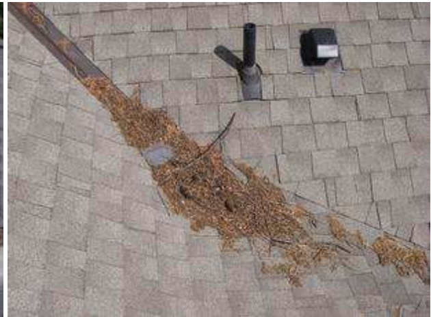
organic and construction debris

10 11 No significant defects were noted in the aluminum gutters but most are obstructed with 12 debris and should be cleaned. Gutters are an integral part of the roof system and in order to 13 properly maintain a roof, the gutters must be kept free flowing. At the ends of the gutters where 14 the water flows onto an adjacent roof plane without the benefit of a downspout, the outfall 15 void should be widened to prevent clogging and reduce the frequency of cleaning. 16