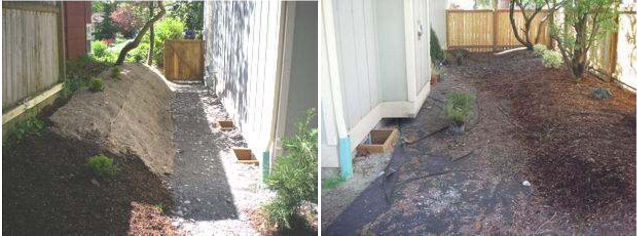
improper soil slope around home