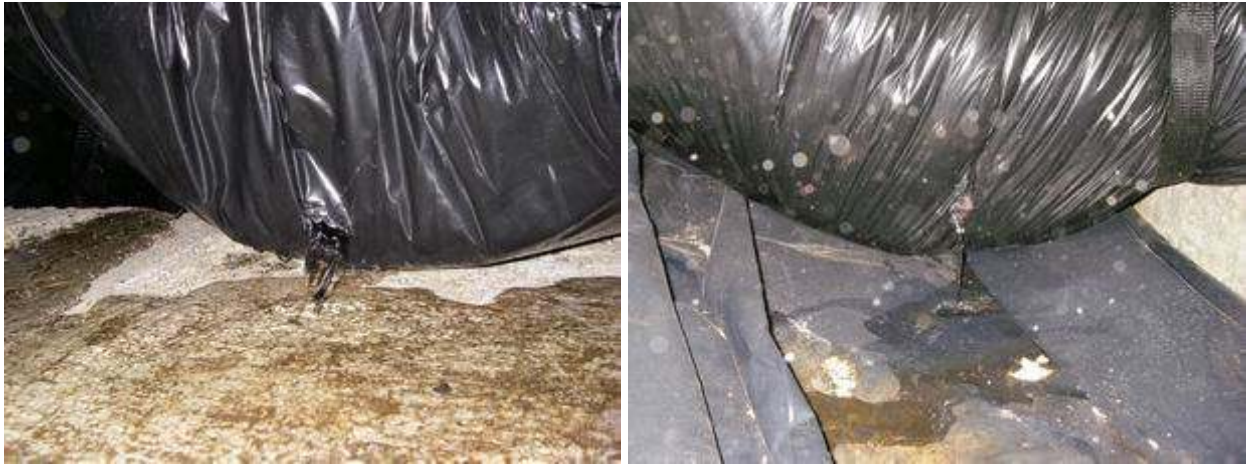
2 3 heat ducts blocked by accumulated water

4 5 Temperature increase measured 47 degrees F., which is within the 45 to 75 degrees 6 specified for this unit. Tests with the Bacharach Monoxor II detector revealed that the unit is 7 releasing no carbon monoxide into the house; carbon monoxide in the house could indicate a 8 defective heat exchanger. Using the TIF 8800 combustible gas detector, the gas supply lines 9 were checked for natural gas leaks and none were detected.