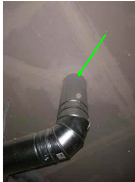
13 14 one-inch clearance required here

15 Radial play in the blower shaft and bearings is not excessive. The blower functions 16 properly and quietly. The cold air return system is unfinished. There is no filter or filter 17 bracket in the filter compartment, which would explain all of the sawdust and construction 18 debris in the blower compartment. At least two of the heat ducts were full of water and 19 others are full of construction debris, and some ducts do not have adequate support. All 20 ducts that have been wet must be replaced and, because the blower and burner 21 compartments of the furnace, as well as nearly all of the heat registers, boots and ducts, 22 contain a substantial amount of construction dust and debris, the entire system should be thoroughly cleaned/vacuumed and new filters installed prior to occupancy.