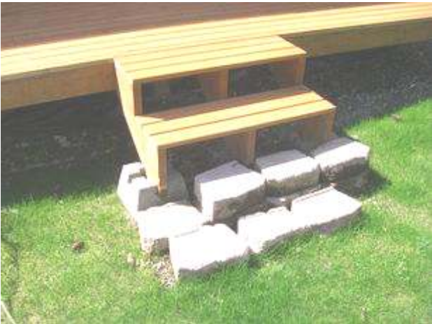
substandard deck steps

The planks at the front entry deck are not adequately screwed down. The rear deck is constructed with 1x4 decking and 2x6 joists 16 inches on center supported in turn by 4x6 beams mounted on 4x4 posts and pier blocks. The steps for the deck are substandard, unprofessional, and hazardous. In addition, a handrail is required for stairs with four risers.