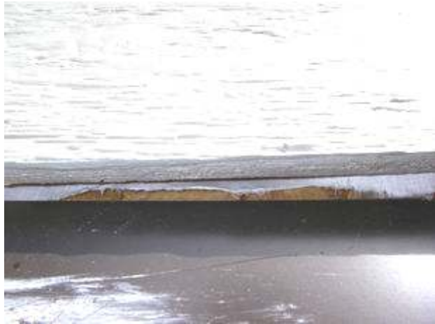
exposed sheathing above roof-to-wall flashing