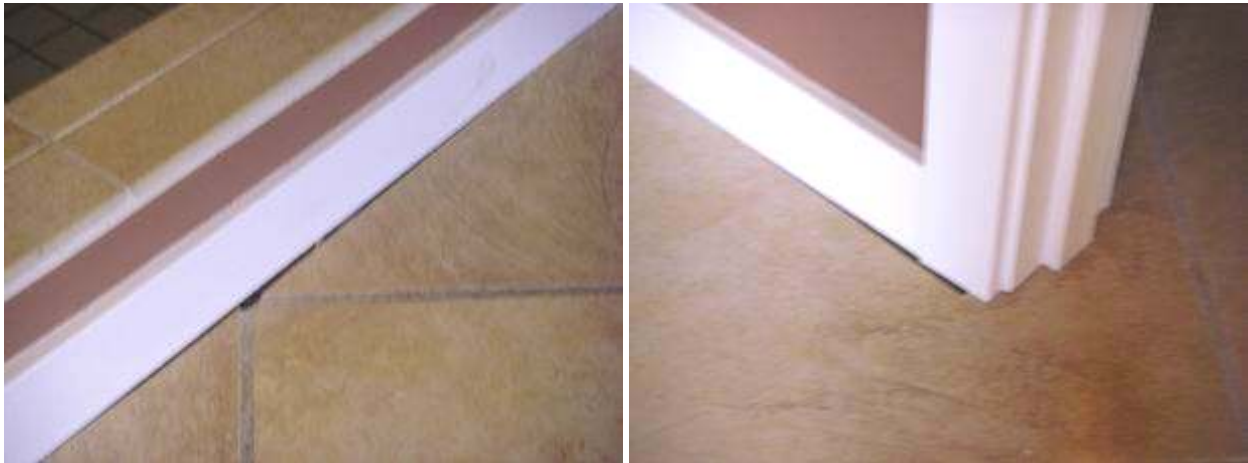
gaps in tile flooring visible here