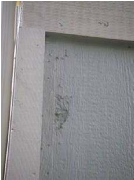
damaged siding skin