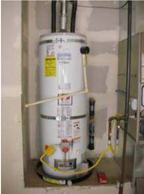
4 5 note discharge pipe and lower earthquake strap

1 Under the vapor barrier, the sewer line has been improperly spliced with no hub 2 fittings and it appears the leak-proof integrity depends on duct tape. 3