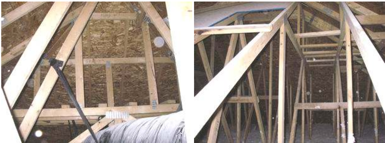
15 16 roof framing, typical 17

10 11 The roof framing consists of truss construction of a 2x4 configuration 24 inches on center 12 with 2x6 and 2x8 rafters in the transition areas. The oriented strandboard sheathing appears to be 13 in serviceable condition. 14