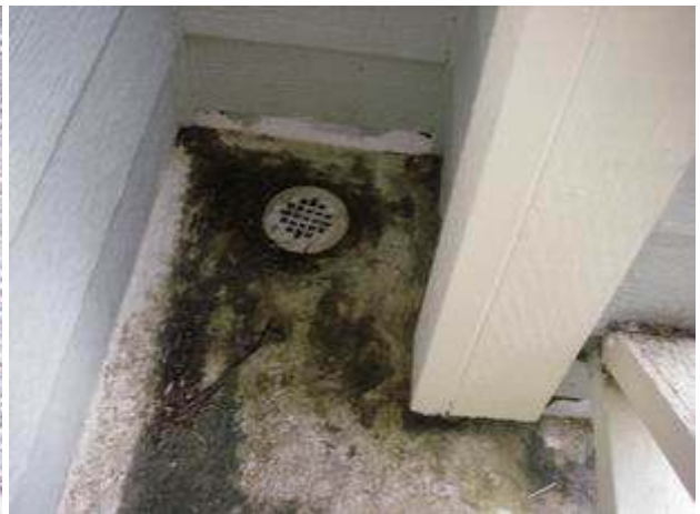
drain grate over entry (see below)