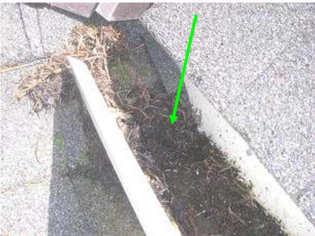
17 18 enlarge opening here for better drainage

10 11 No significant defects were noted in the aluminum gutters but most are obstructed with 12 debris and should be cleaned. Gutters are an integral part of the roof system and in order to 13 properly maintain a roof, the gutters must be kept free flowing. At the ends of the gutters where 14 the water flows onto an adjacent roof plane without the benefit of a downspout, the outfall 15 void should be widened to prevent clogging and reduce the frequency of cleaning. 16