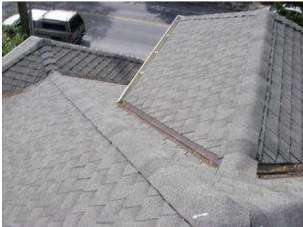
8 9 laminated architectural-style composition roof

1 The roof consists of one tier of laminated architectural-style asphalt/fiberglass composition 2 shingles. No significant defects were noted in the roofing material or valley or vertical plane 3 flashing. A considerable amount of construction debris has been left on the roof; the debris 4 should be picked off the roof and out of the gutters to prevent it from entering the 5 downspouts and drain lines. Any cellulose debris accumulation should also be removed from 6 the roof surfaces and gutters. 7