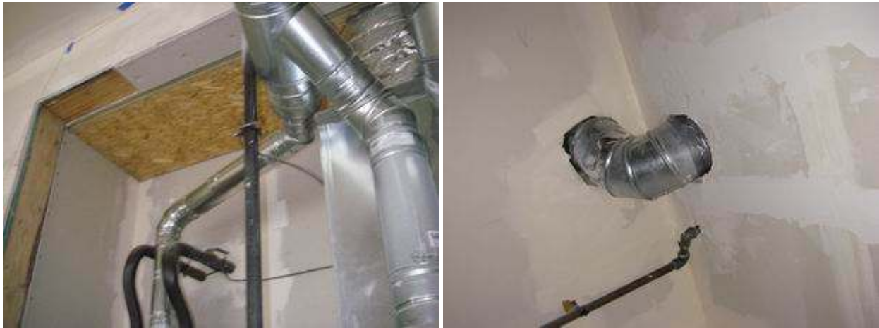
23 24 integrity of fire-rating must be improved

18 19 The concrete slab floor is in serviceable condition, with normal settling cracks. The wall 20 and ceiling work for the fire-rated separation between the garage and living areas is 21 incomplete. 22