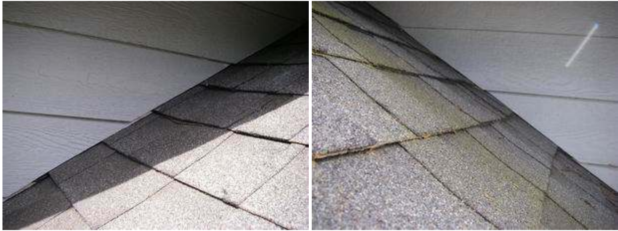
11 12 siding touching roofing (should be a two inch gap)

5 6 Of equal concern is that at the front of the dormer, the siding does not come down 7 far enough and has left the sheathing exposed, and the requisite vapor barrier (paper or 8 wrap) is not visible. It is somewhat worrisome that at the only area visible that should 9 reveal paper, none exists.