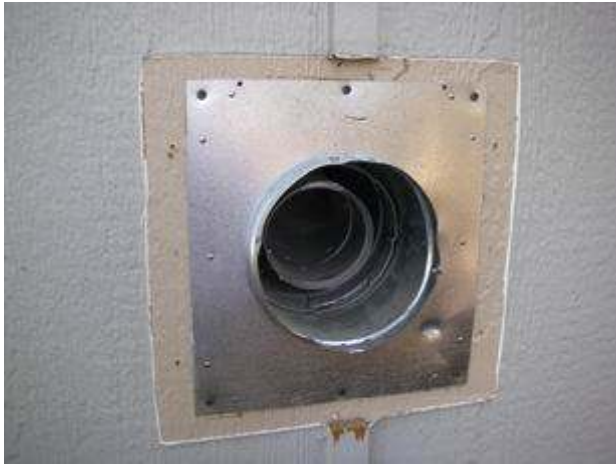
11 missing cap at fireplace

7 The sealed gas fireplace is not yet fired, possibly because the exterior flue cap is 8 missing. The purpose of the stubbed off gas line next to the fireplace is unknown but if it is 9 not needed it should be properly terminated and the wall returned to a finish condition. 10